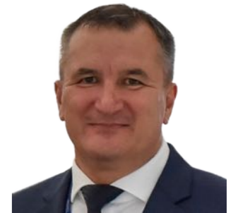
General (ret.) Daniel Petrescu Chief of the Defence Staff, Romanian Ministry of Defence December 2019-November 2023

Like many of our officers I trained in Britain learning not just tactics but ways of thinking. The UK values initiative, accountability, and getting things done. Romania brings its own unique experiences and knowledge. By working together – at military to military level, at government to government level, and by building better defence industry partnerships – we can create a new joint commitment to peace and security on NATO's eastern flank.